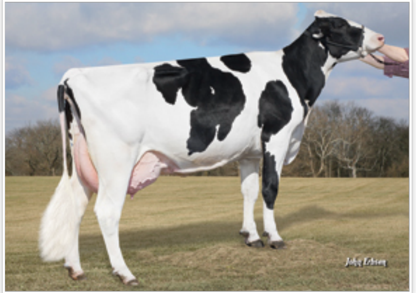
Andreas Sublime 923-Grade