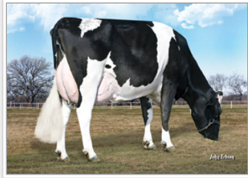
Goff Sublime 33391